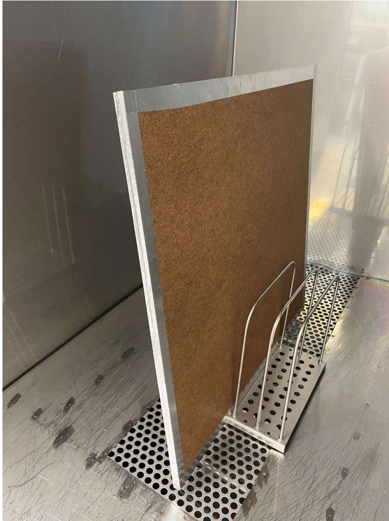
Photo of the test specimen